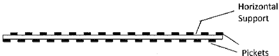
Shadow Box, Top View (not to scale)

Installation: Fences shall be level, straight and aligned without wavering. Fences that tie into brick walls shall be the same height of the brick wall which is 48”.